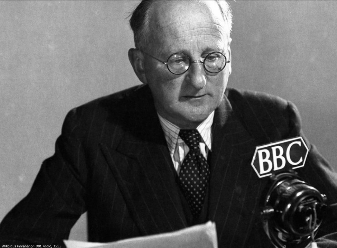
Nikolaus Pevsner on BBC radio, 1955