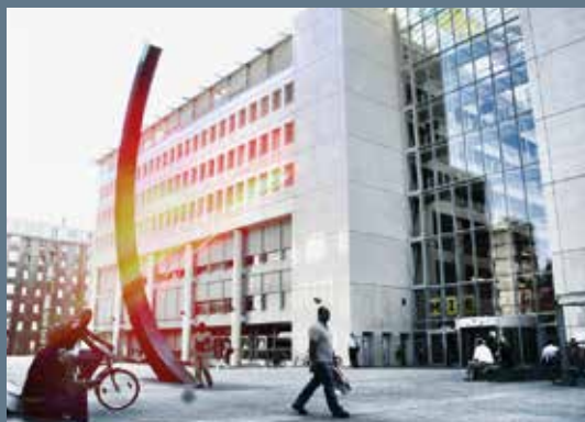
University of Geneva Uni Mail Building

September 12 th -14 th 2018 EARLI SIG 14 Conference