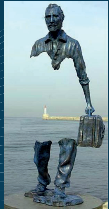
© Le GRAND VAN GOGH, BRONZE ORIGINAL, 70 x 20 CM

Vendredi 24 mai 2019 et samedi 25 mai 2019