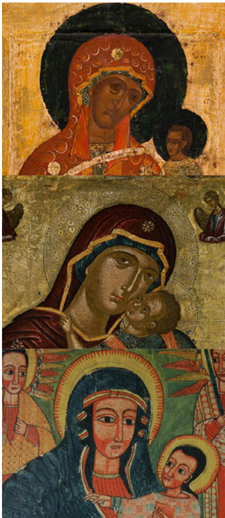
La Mère de Dieu, montagne inviolée ; Novgorod (xv e s.), Musée des Beaux-Arts de la Ville de Paris, Petit Palais, PPP4902

Institut national d'histoire de l'art – 2, rue Vivienne 75002 Paris (Room Vasari)